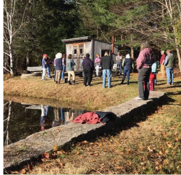
Public information meeting at Chris's Pond.