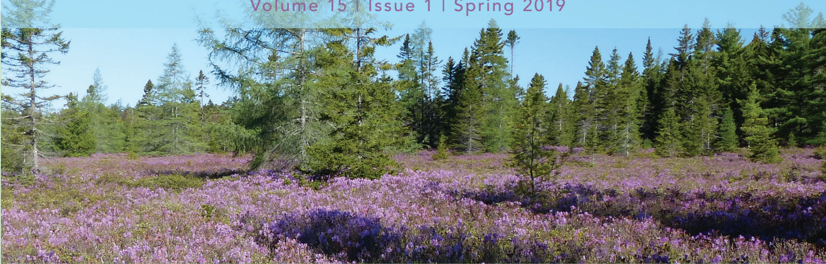
Jones Marsh in bloom. IHT's new neighborhood will be created on the uplands from this preserved wetland.

a newsletter of Island Housing Trust Volume 15 | Issue 1 | Spring 2019