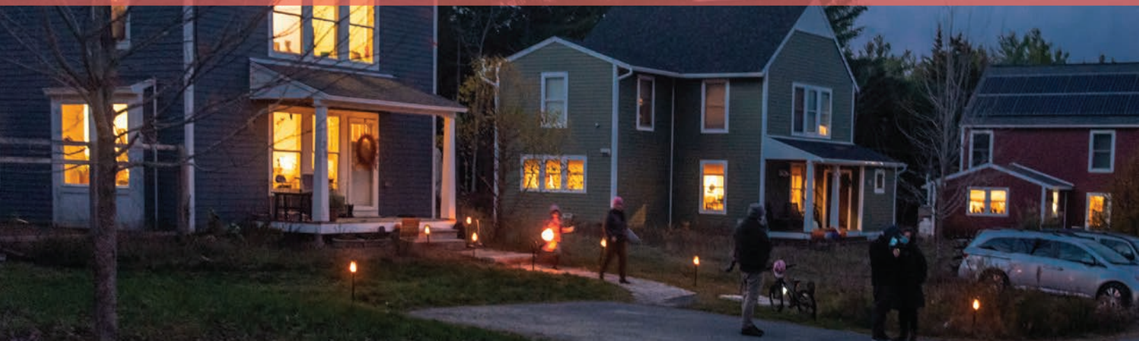
Late fall evening in the Ripples Hill neighborhood.

a newsletter of Island Housing Trust Volume 16 | Issue 2 | Fall/Winter 2020