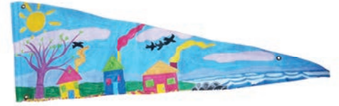
Mount Desert Elementary School banner, ca. 2006

Island Housing Trust is working to support our island communities