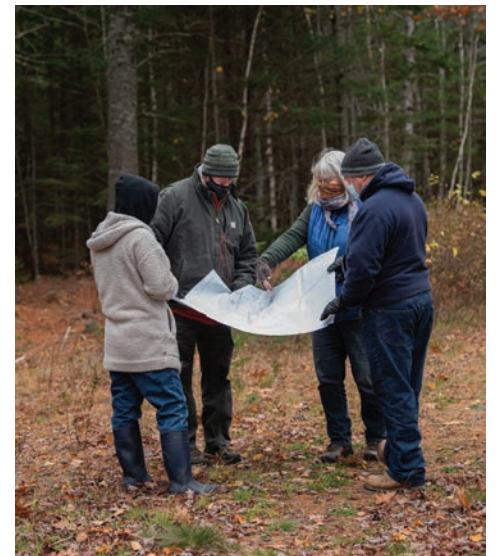
IHT at Jones Marsh.

supply. Other planning underway includes final estimates and designs for the homes. Jones Marsh will be a neighborhood of ten energy-efficient homes on approximately seven acres, with the option for two duplexes to provide diverse price points for ownership. IHT staff is working with local modular companies to develop energy-efficient and attractive buildings, with a New England flair. This will be a year-round neighborhood, and eligible homeowners will earn a median income, with at least part of that earned from work on MDI. We'll keep you posted as the project continues to move along.