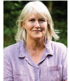
EAGER EYE PHOTOGRAPHY