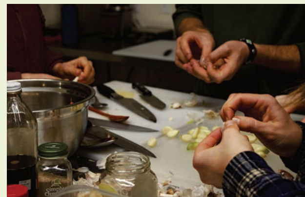
Neighbors preparing a meal.