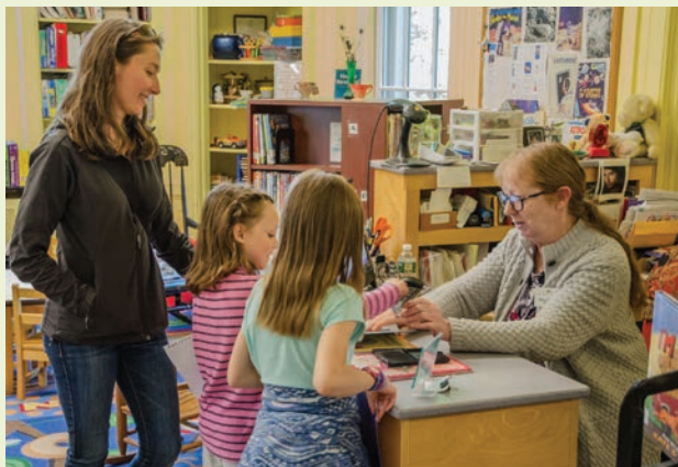
IHT family enjoying time at the Jesup Library.

We are always happy to talk with you and answer your questions.