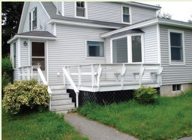
Bar Harbor home under affordability covenants, protected through a partnership with Maine Coast Heritage Trust.