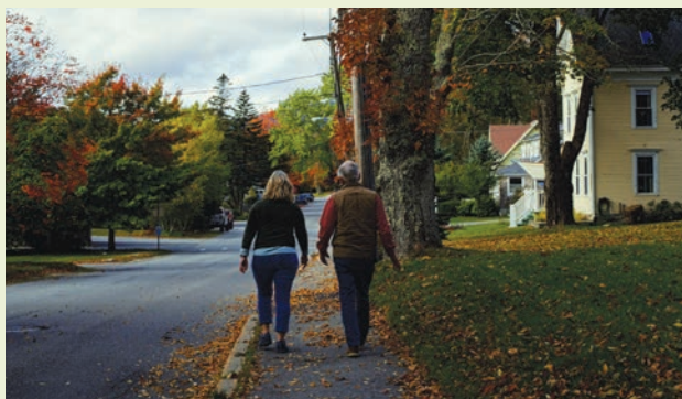
Autumn walk through the neighborhood.