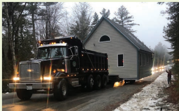
Anonymous donated Beech Hill Road house on the move to its new site, donated by the Town of Mount Desert.