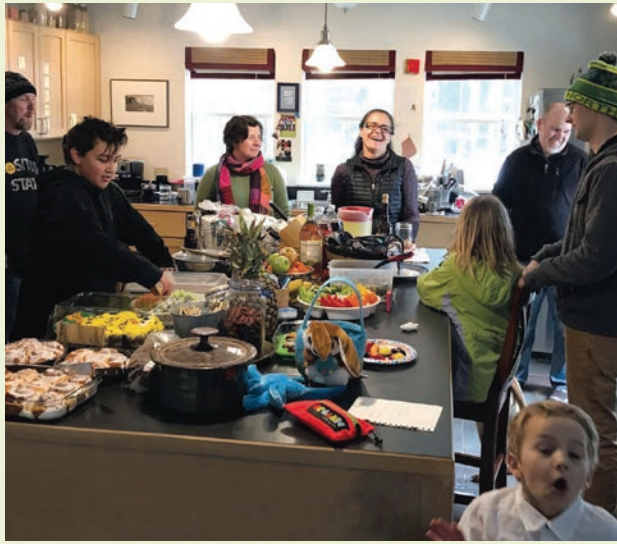
Ripples Hill neighborhood gathering.