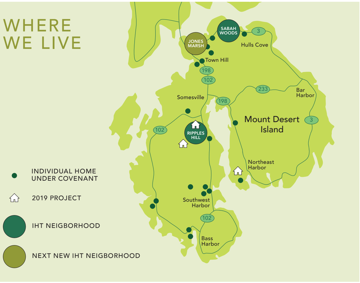
Map concept by College of the Atlantic GIS Laboratory